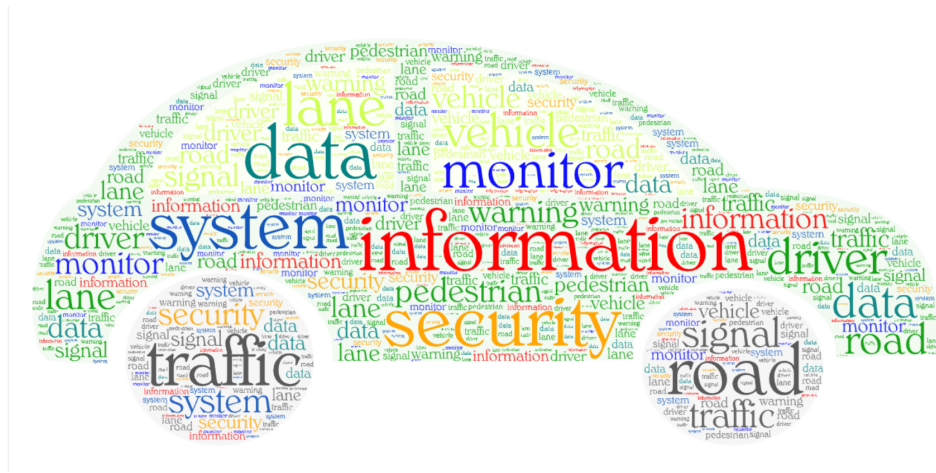
Figure 4: The word cloud representation of user demands in the Transportation Field

As shown in figure 4, in the word cloud representation of user demands, the frequent appearance of words like “safety,” “monitoring,” and “warnings” indicates that users primarily desire safety aspects in the transportation system[5]. This also reflects the enduring mission of automotive enterprises to ensure user safety.